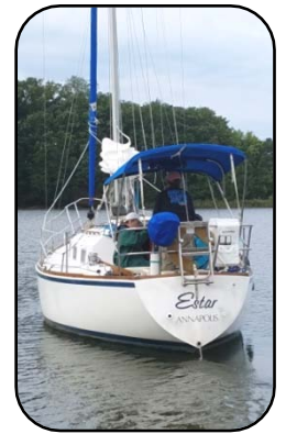
Estar Photo by Cecil Alan