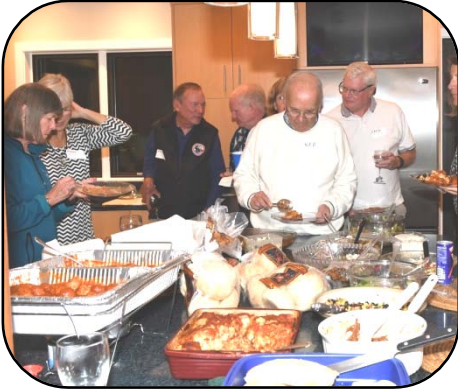
Time to eat!