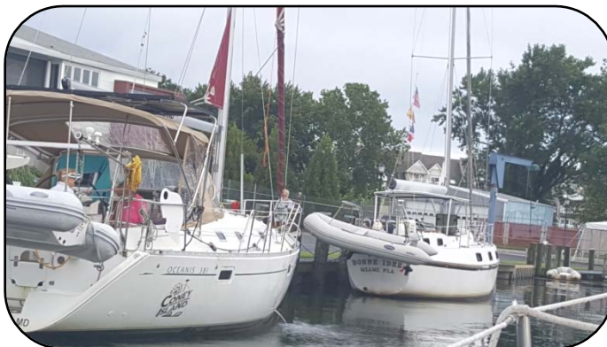
SOS Boats