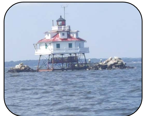
Thomas Point