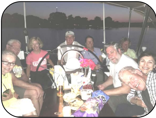
Gathering on cockpit of Sea Tango